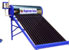
ETC Solar Water Heater