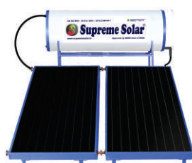
FPC Solar Water Heater