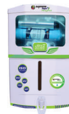
RO Water Purifier