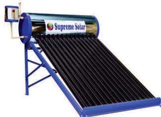
ETC Solar Water Heater